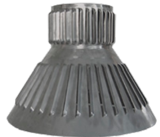
WL type mist eliminator