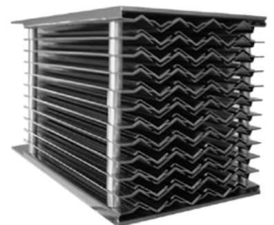
Chevron Pack type mist eliminator