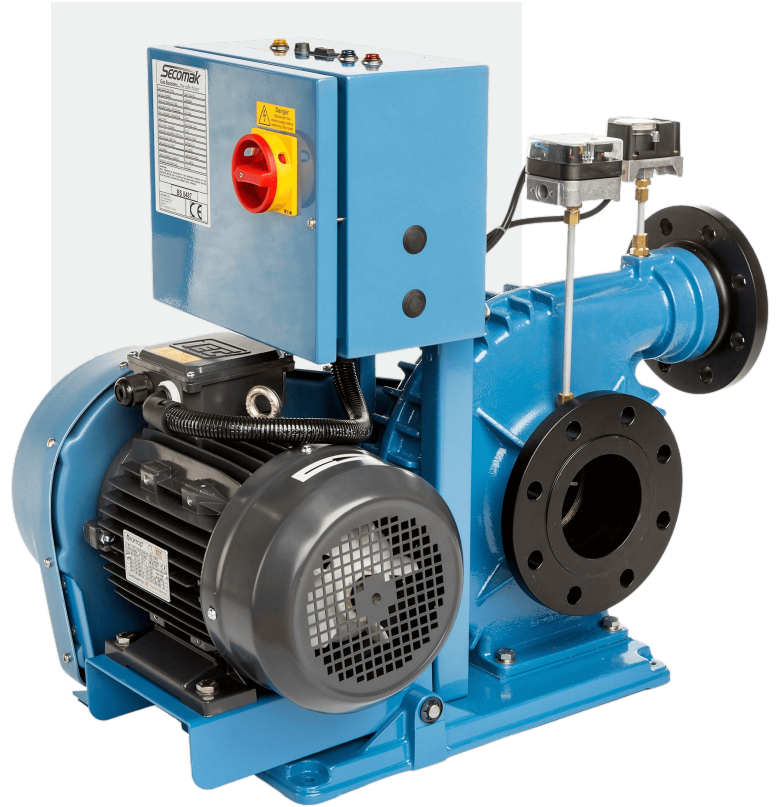
Product supplied may differ from image based on pressure requirements. Image represents Package Gas Booster including controls.