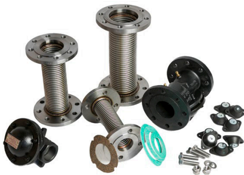
Installation Kit Included with all Package Gas Boosters.

Available as a Package or Stand-Alone system. Available packages overleaf.