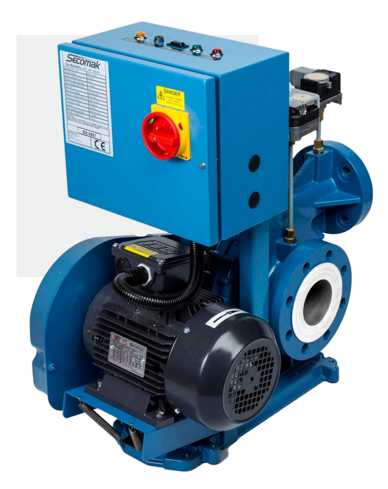
Product \ supplied \ may \ differ \ from \ image \ based \ on \ pressure \ requirements. Image represents Package Gas Booster including controls.