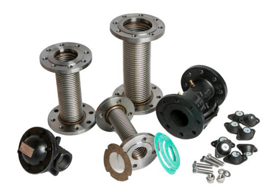
Installation Kit Included with all Package Gas Boosters.

Available as a Package or Stand-Alone system. Available packages overleaf.